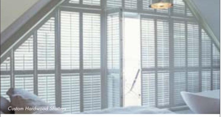
Incredible Savings, Promotions, and Upgrades On Shutters & More Going On Now!*

Contact your local Style Consultant for amazing offers in your area!